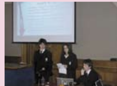
Students from St. Columba's College doing a presentation at the senior conference 1