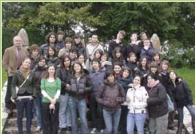
Pictured are students and coordinators involved in the recent school visit by Liceo Scientifico 'G Marconi', Italy to Garbally College, Ballinasloe on the 22nd April 2008

If you know of any schools that would like to join ESP please send them the ESP details or contact us in the office. If you would like a school visit please contact the office for details of 2008/09 schedules.