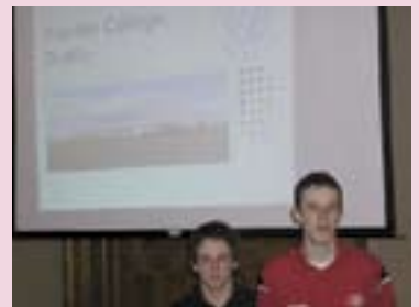
Students from Plunket College who gave an excellent presentation also at the second senior conference